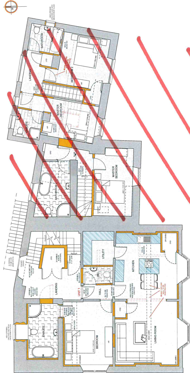
FIRST FLOOR PLAN (REVISED)