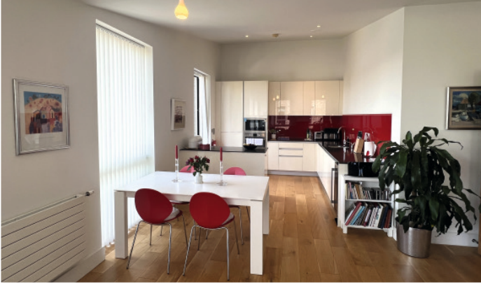
Interior view of Kitchen/Dining area