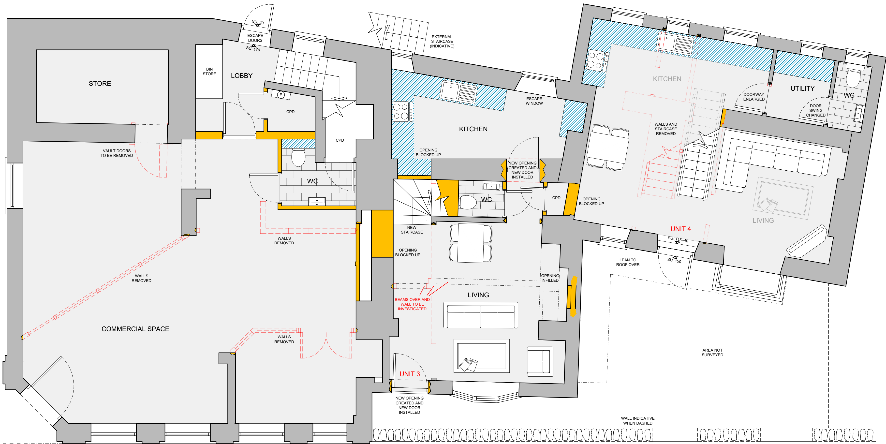
GROUND FLOOR PLAN [SCALE 1:50]