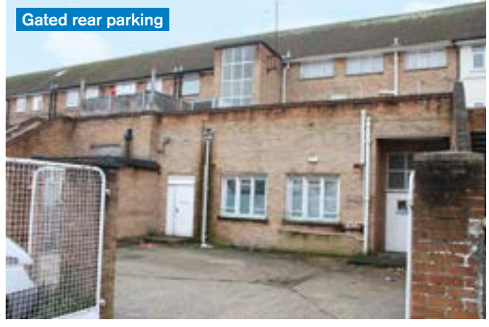
VAT is NOT applicable to this Lot