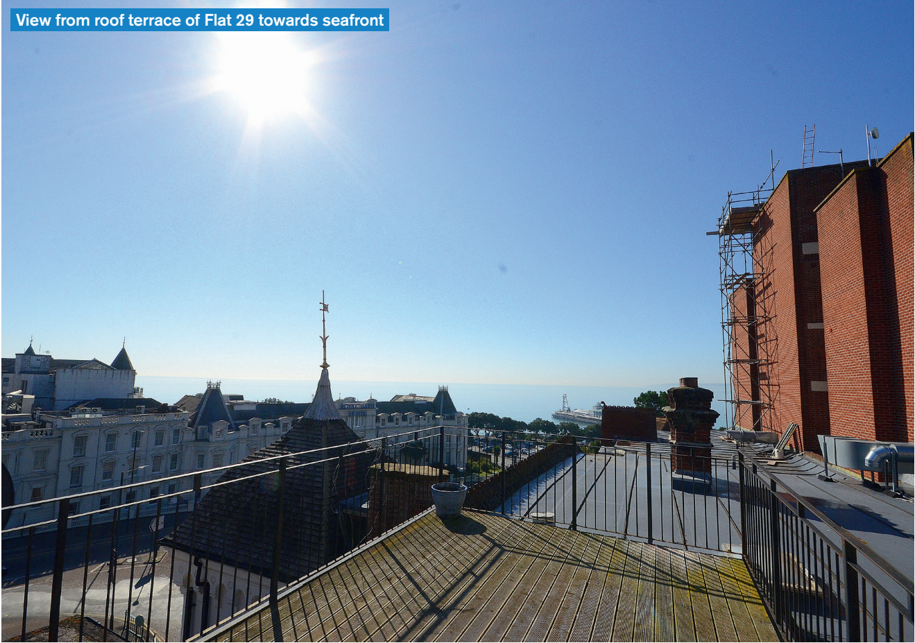
View from roof terrace of Flat 29 towards seafront