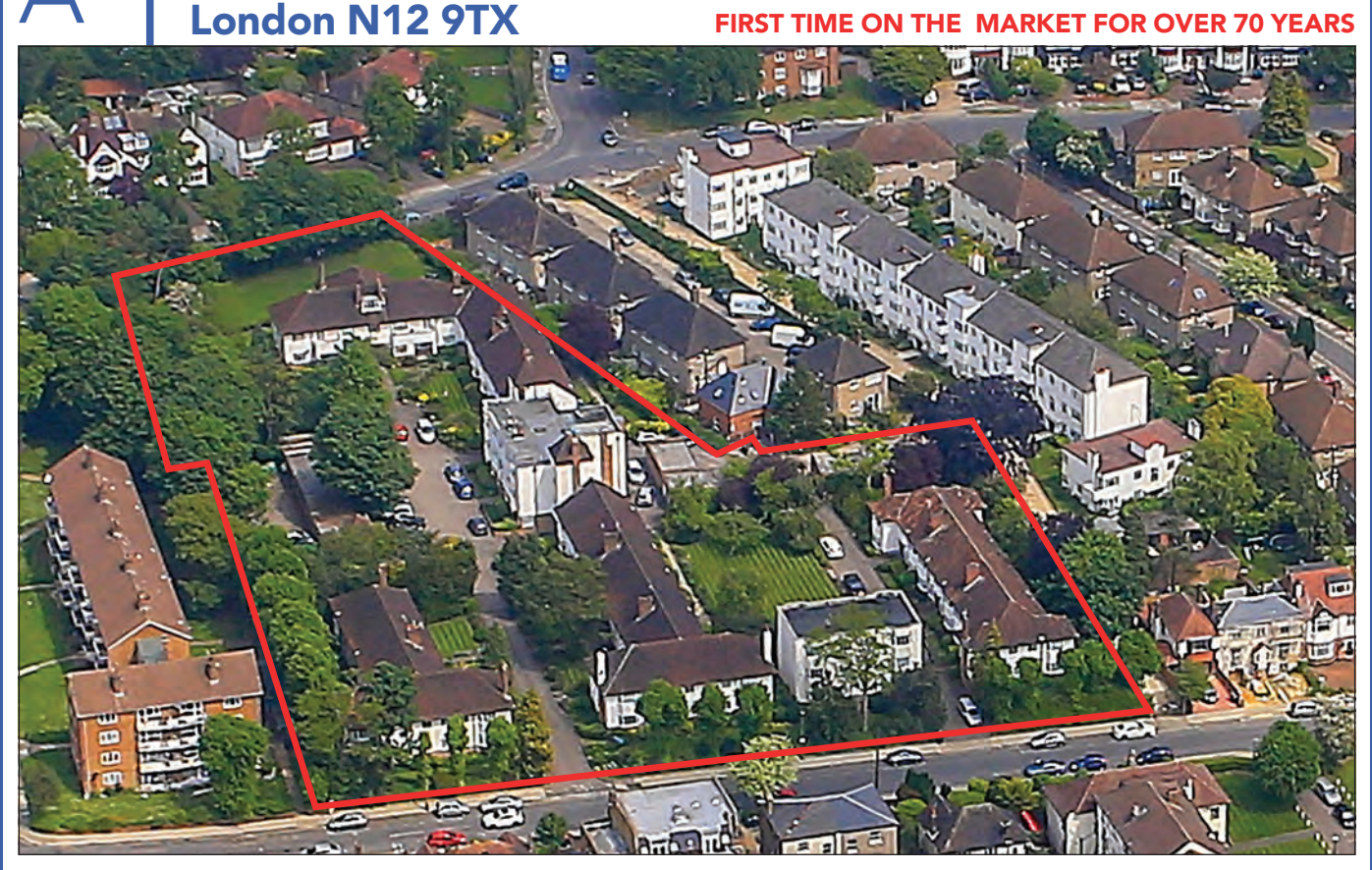
An Unbroken Residential Estate comprising:

Flats 1–65 Okehampton Close, *Guide: £16,000,000+ ON BEHALF OF THE FOYLE FOUNDATION