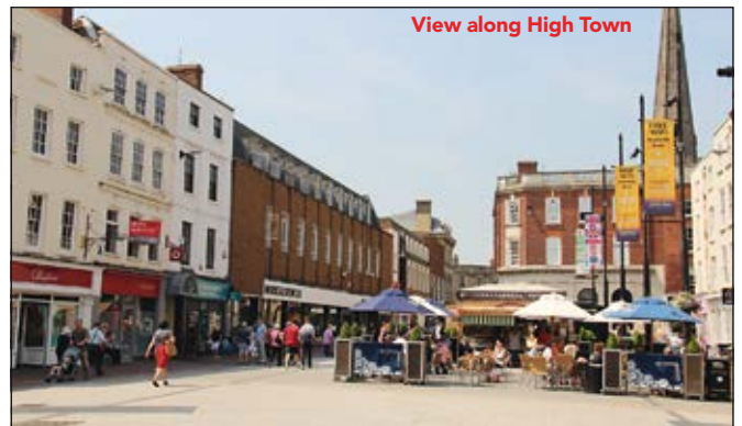
View along High Town