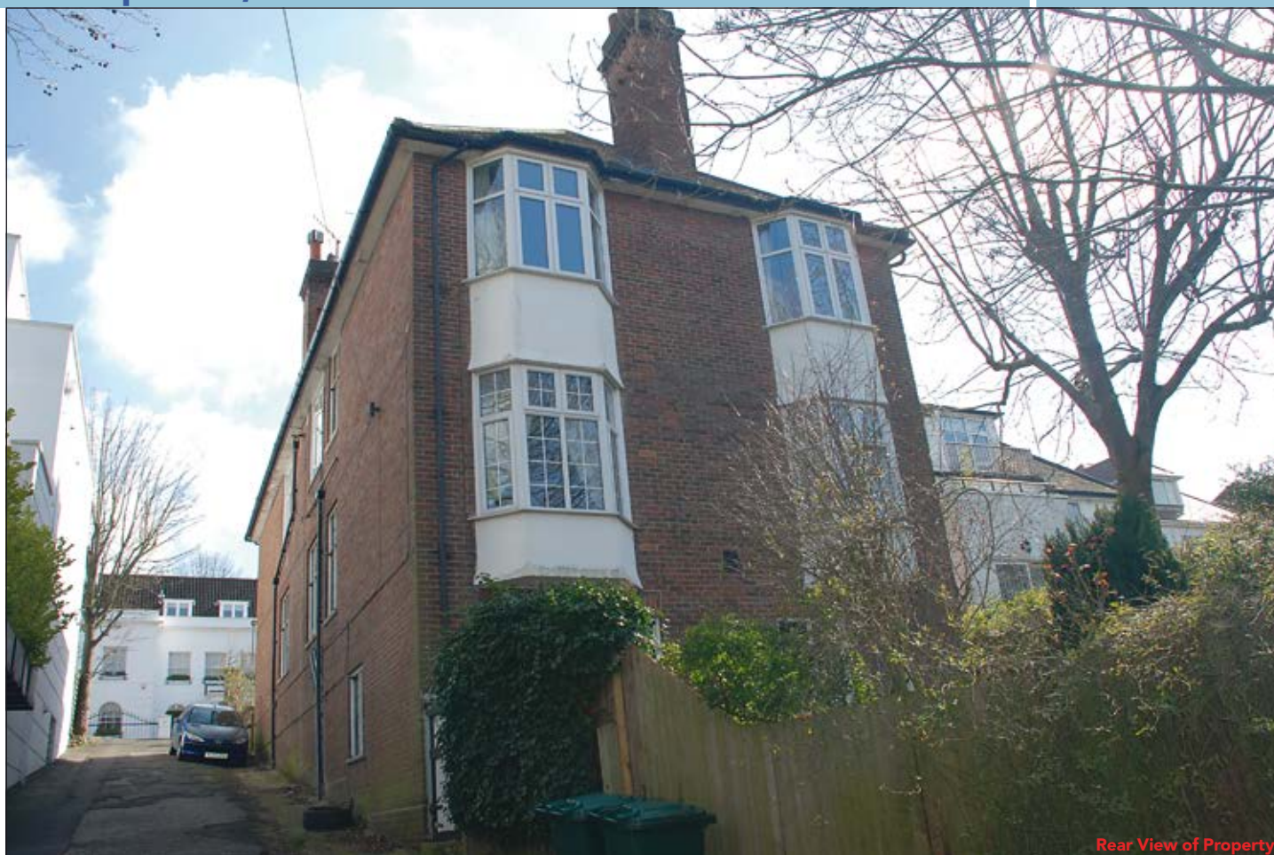
Rear View of Property