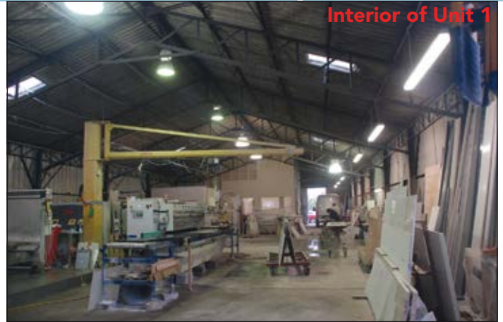
Interior of Unit 1