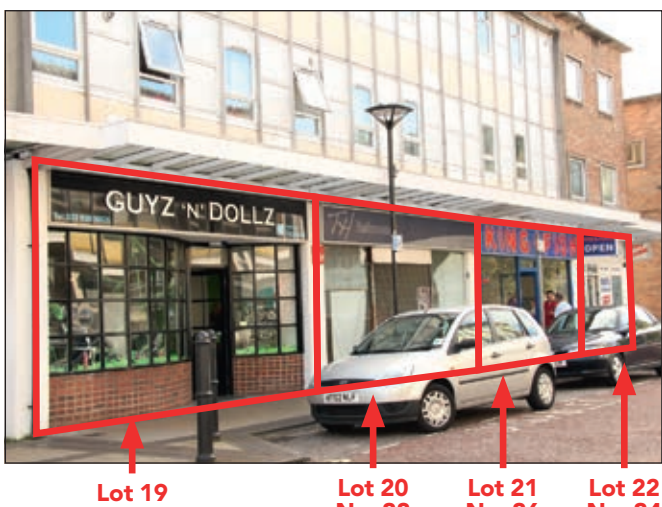
No. 40 No. 38 No. 36 No. 34

Each Leasehold for a term of 999 years from completion.